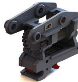
ROTARY TILT HITCH